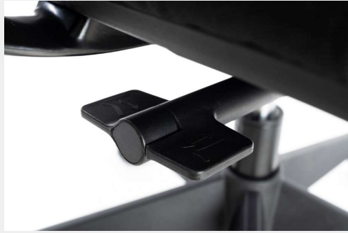
Seat Height & Depth Adjustment