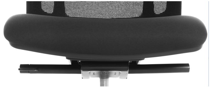
Sleek and simple to operate mechanism.