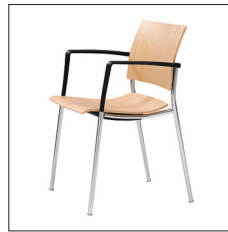
4 leg, arms