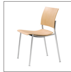
4 leg, no arms