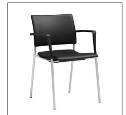
Fully upholstered, arms